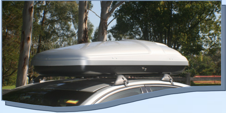
Travel Twin 460