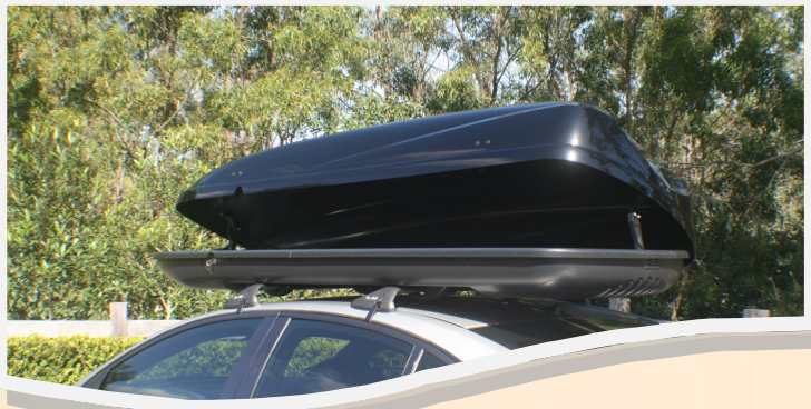
Travel Exclusive 650