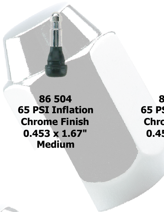
86 504 65 PSI Inflation Chrome Finish 0.453 x 1.67" Medium