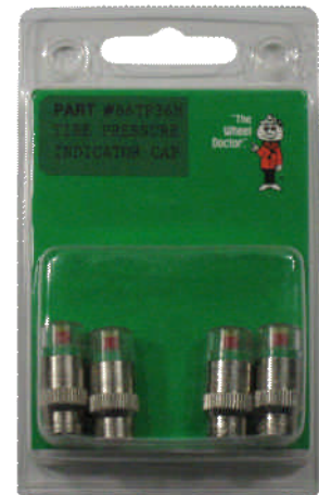
86 TP36M 36 PSI Set of 4