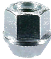
Open End Bulge Acorn Lug Nuts OEM Style