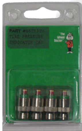
86 TP32M 32 PSI Set of 4

Chrome Cap with easy to read tyre pressure indicator. Replaces standard caps. Check tyre pressure at a glance. Colour changes when under pressure.